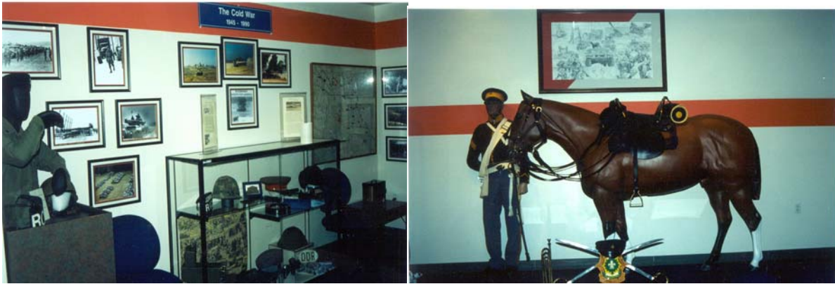
Reed Museum Displays at Fort Polk