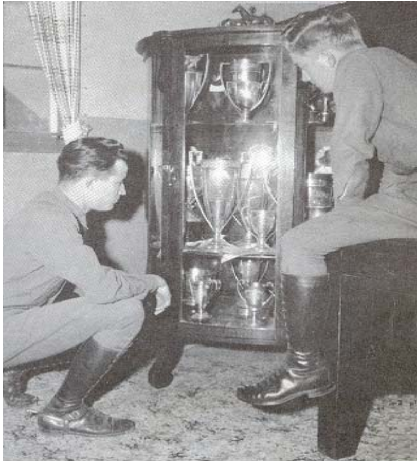
Two 2nd U.S. Cavalry soldiers look at part of the collection of Riding Trophies, earned by the Regiment. Fort Riley, KS 1940