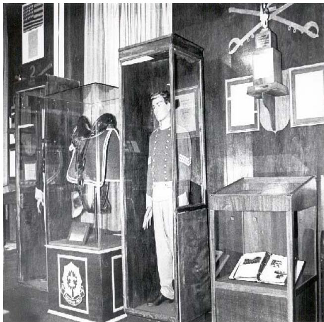
Collection items on display at Nuremburg, Germany.