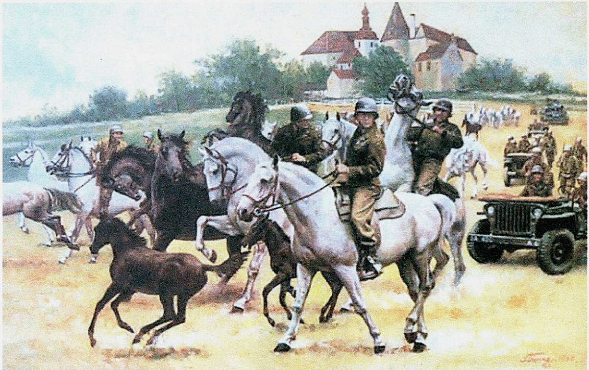
Print courtesy of Don Stivers

streaming through the Eisenstein Pass across the Czechoslovakian border. How ironic that one of the 2nd Cavalry's greatest threats from the past would wish to bestow such honors on two of its lost troopers all but forgotten by the rest of the world.